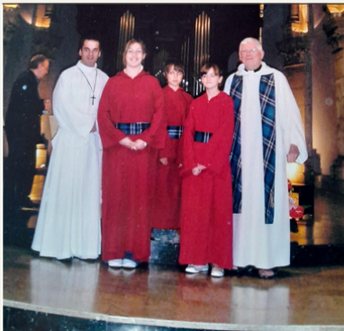
I was an altar server at Our Lady & St Andrew's in Galashiels. That's me on the left.