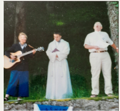
Here's me in Lourdes, France, in 2002. Great memories!