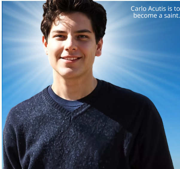
Carlo Acutis is to become a saint.