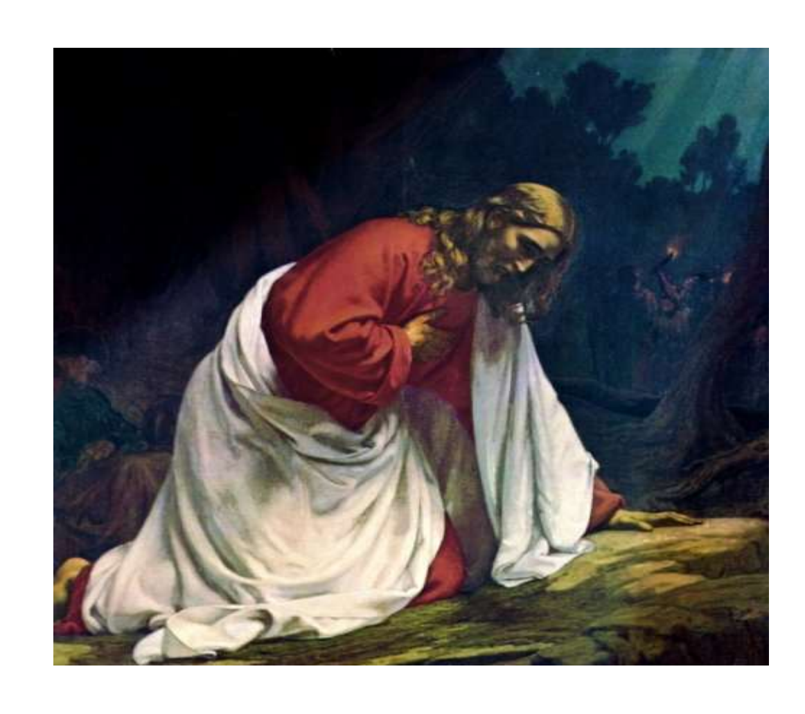
Holy Week Service

We watch with the Lord in the Garden of Gethsemane